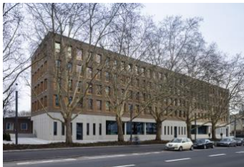
WiSo, Köln @HGEsch