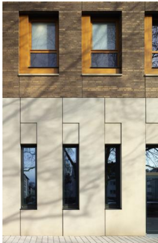
WiSo, Köln