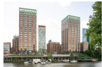
WinWin, Mediahafen Düsseldorf