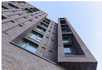
HolidayInn, Lohsepark, HafenCity Hamburg