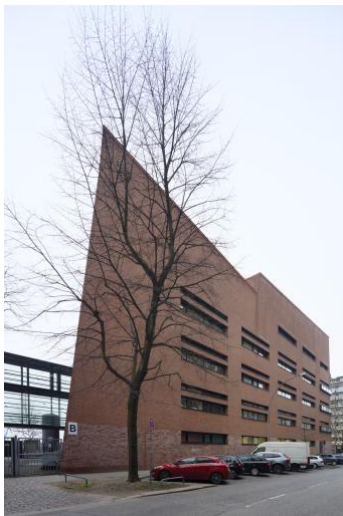
Bernhard-Nocht-Institut, Hamburg