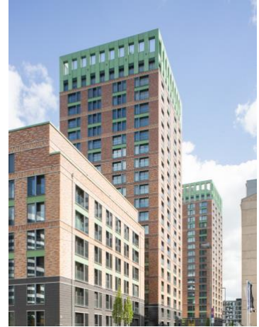
WinWin, Mediahafen Düsseldorf