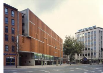
Parkhaus Pressehaus, Bremen