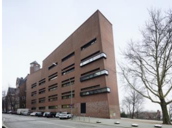
Bernhard-Nocht-Institut, Hamburg