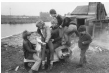
Ursula Schulz-Dornburg, Image from Huts, Temples, Castles (MACK, 2022). Courtesy of the artist and MACK