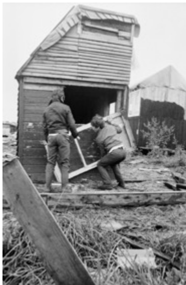
Ursula Schulz-Dornburg, Image from Huts, Temples, Castles (MACK, 2022).