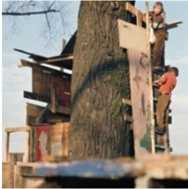
Ursula Schulz-Dornburg, Image from the series Huts, Temples, Castles . Courtesy of the artist