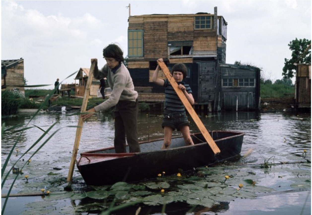
Ursula Schulz-Dornburg, Image from Huts, Temples, Castles (MACK, 2022). Courtesy of the artist and MACK