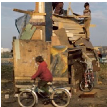
Ursula Schulz-Dornburg, Image from Huts, Temples, Castles (MACK, 2022).