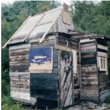
Ursula Schulz-Dornburg, Image from Huts, Temples, Castles (MACK, 2022).