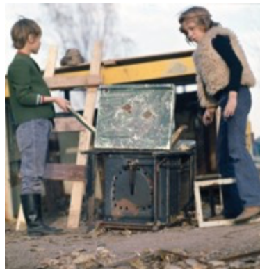
Ursula Schulz-Dornburg, Image from the series Huts, Temples, Castles .