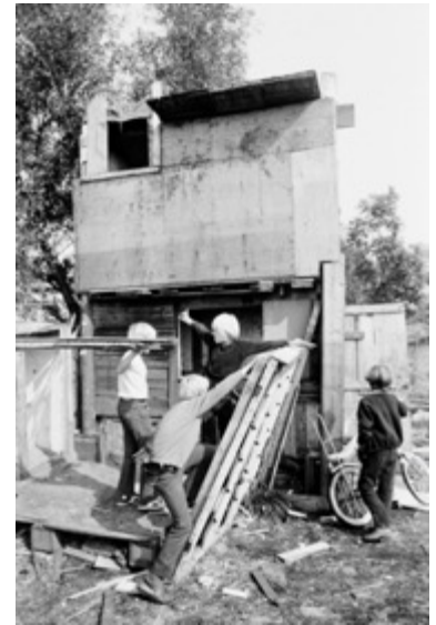
Ursula Schulz-Dornburg, Image from Huts, Temples, Castles (MACK, 2022).