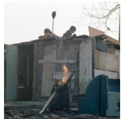
Ursula Schulz-Dornburg, Image from the series Huts, Temples, Castles .