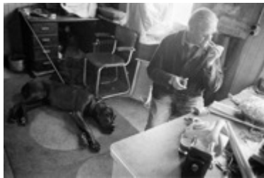
A former policeman and his dog taking care of the site, the kids and the animals, Image from the series Huts, Temples, Castles . Courtesy of the artist