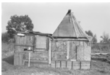
Ursula Schulz-Dornburg, Image from Huts, Temples, Castles (MACK, 2022). Courtesy of the artist and MACK