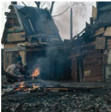
Ursula Schulz-Dornburg, Image from the series Huts, Temples, Castles . Courtesy of the artist