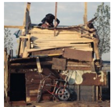
Ursula Schulz-Dornburg, Image from Huts, Temples, Castles (MACK, 2022).