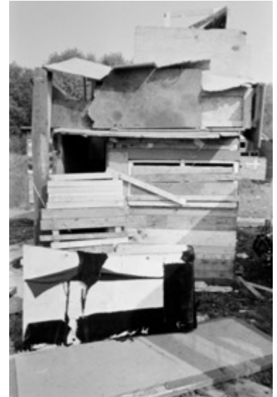
Ursula Schulz-Dornburg, Image from Huts, Temples, Castles (MACK, 2022).