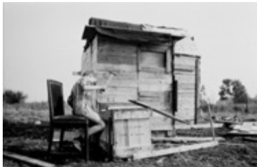
Ursula Schulz-Dornburg, Image from Huts, Temples, Castles (MACK, 2022).