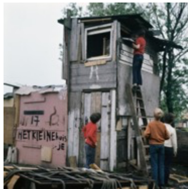
Ursula Schulz-Dornburg, Image from Huts, Temples, Castles (MACK, 2022).