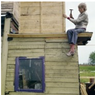
Ursula Schulz-Dornburg, Image from Huts, Temples, Castles (MACK, 2022). Courtesy of the artist and MACK