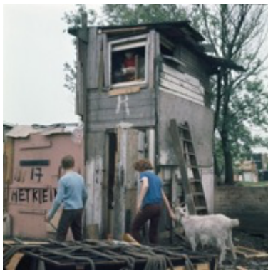
Ursula Schulz-Dornburg, Image from the series Huts, Temples, Castles . Courtesy of the artist