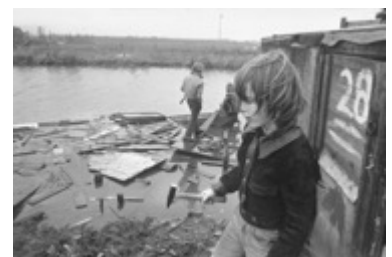
Ursula Schulz-Dornburg, Image from the series Huts, Temples, Castles .