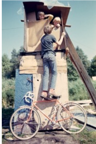
Ursula Schulz-Dornburg, Image from Huts, Temples, Castles (MACK, 2022). Courtesy of the artist and MACK