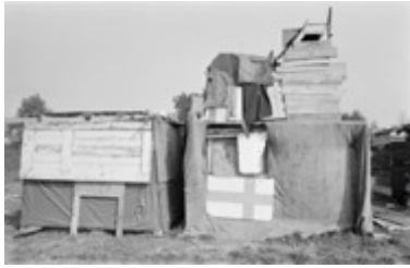
Ursula Schulz-Dornburg, Image from Huts, Temples, Castles (MACK, 2022).