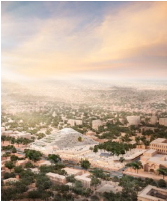
Aerial view of the National Assembly of Burkina Faso , Kéré Architecture. © Kéré Architecture