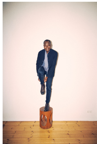
Francis Kéré, Berlin, 2021.