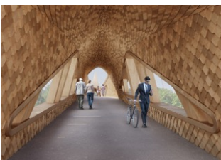
Taylor Bridge, Mannheim, Kéré Architecture.