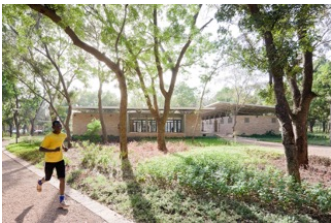
National Park of Mali , Kéré Architecture.