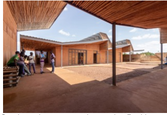
Students in conversation at the Burkina Institute of Technology, Kéré Architecture.