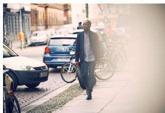
Francis Kéré, Berlin, 2021.