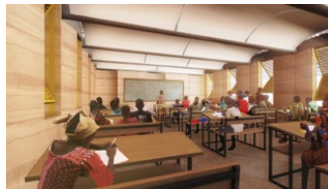
Auditorium of the Naaba Belem Goumma Secondary School , Kéré Architecture. © Kéré Architecture