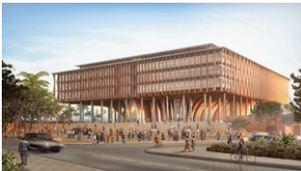
Benin National Assembly , Kéré Architecture. © Kéré Architecture