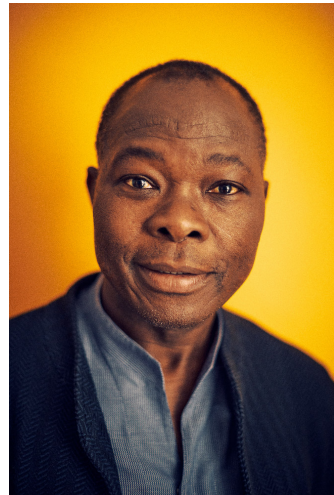
Francis Kéré, Berlin, 2021.