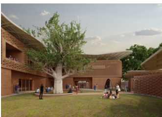
Exterior view of the Goethe-Institut Senegal , Kéré Architecture.