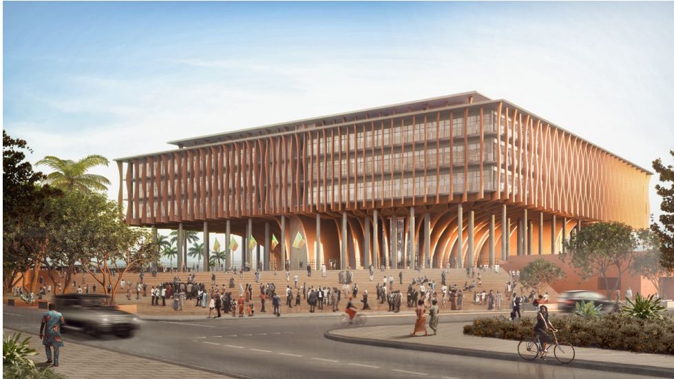
Benin National Assembly, in planning. Architecture: Kéré Architecture. © Kéré Architecture

In cooperation with AW Architektur & Wohnen