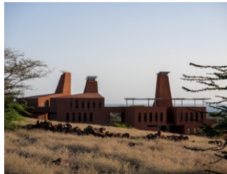
Startup Lions Campus , Kéré Architecture. © Kéré Architecture