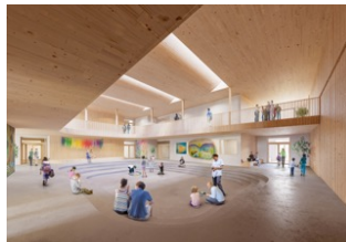
Auditorium of the Waldorfschule Weilheim , Munich, Kéré Architecture. © Kéré Architecture