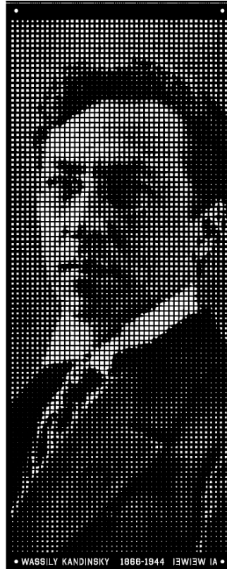
Wassily Kandinsky Portrait © Ai Weiwei