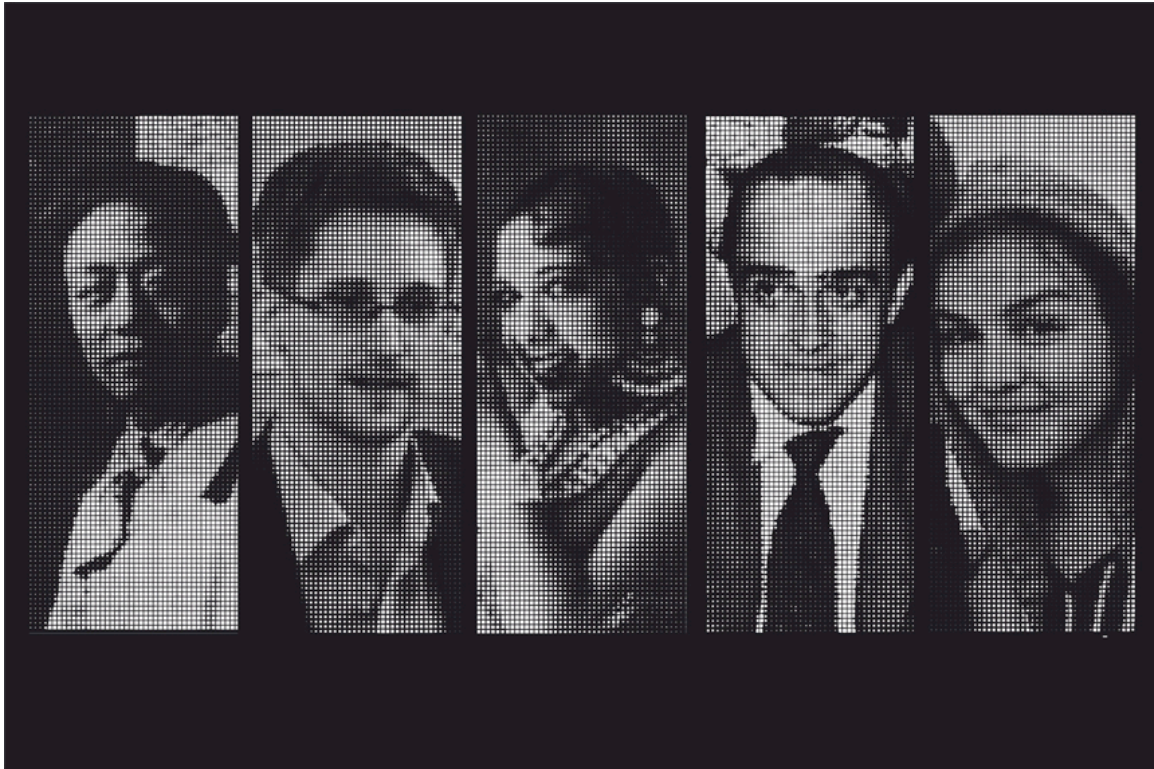
Portraits © Ai Weiwei

Exhibition: 31 October 2020 - 7 January 2021