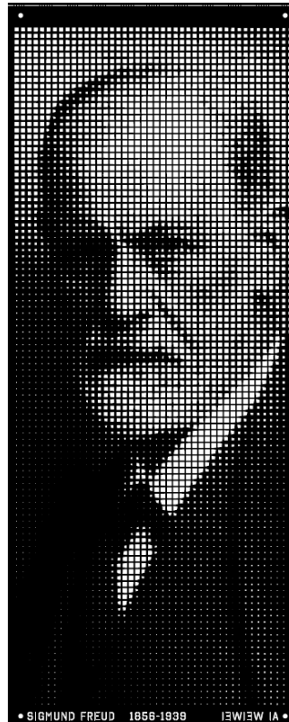
Sigmund Freud Portrait © Ai Weiwei