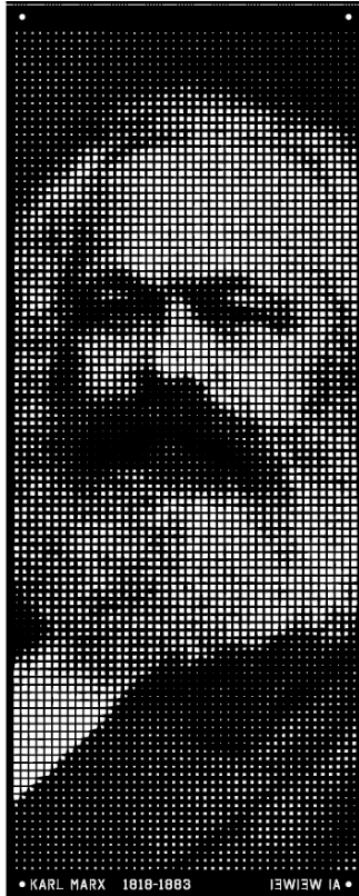
Karl Marx Portrait © Ai Weiwei