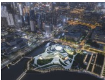
NINGBO URBAN PLANNING EXHIBITION CENTER_playze & Schmidhuber. © CreatAR Images