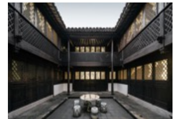
SHAOXING GUESTHOUSE_playze. © playze