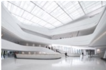
NINGBO URBAN PLANNING EXHIBITION CENTER_playze & Schmidhuber.