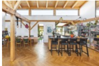
MOOS_playze & Thomas Kröger Architekten.