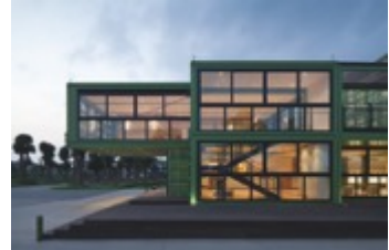
TONY'S FARM_playze.