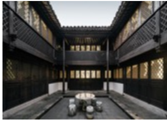
SHAOXING GUESTHOUSE_playze.