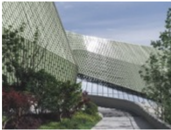
NINGBO URBAN PLANNING EXHIBITION CENTER_playze & Schmidhuber.