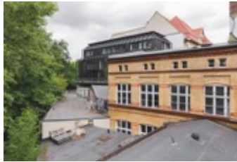
MOOS_playze & Thomas Kröger Architekten.