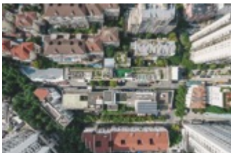
XINGFULI_playze. © playze