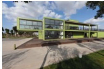
TONY'S FARM_playze.