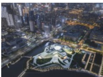
NINGBO URBAN PLANNING EXHIBITION CENTER_playze & Schmidhuber.