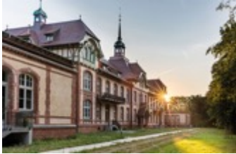
REFUGIUM BEELITZ_playze.