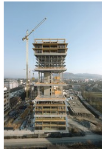
HOLLIGER TOWER_playze & TEN.