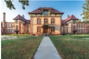
REFUGIUM BEELITZ_playze.