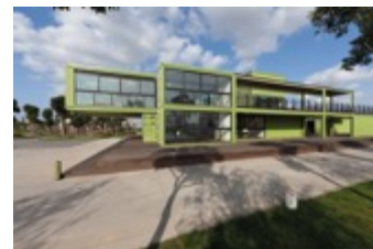
TONY'S FARM_playze.