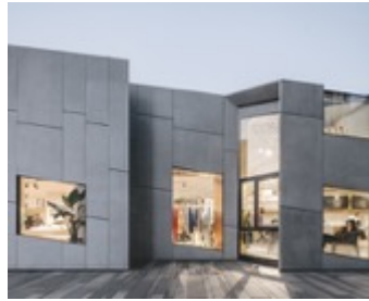
XINGFULI_playze. © playze/Zhu Siyu