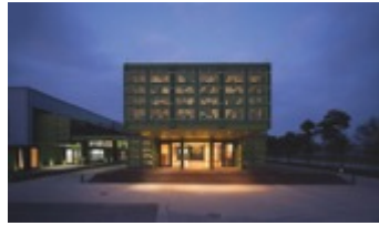
TONY'S FARM_playze.