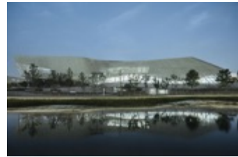
NINGBO URBAN PLANNING EXHIBITION CENTER_playze & Schmidhuber. © CreatAR Images