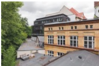
MOOS_playze & Thomas Kröger Architekten.