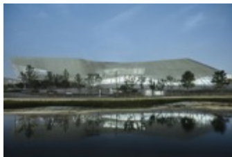
NINGBO URBAN PLANNING EXHIBITION CENTER_playze & Schmidhuber.