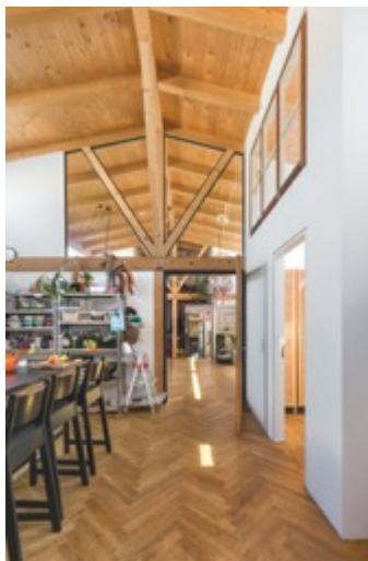
MOOS_playze & Thomas Kröger Architekten.