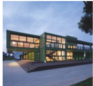
TONY'S FARM_playze.