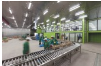
TONY'S FARM_playze.