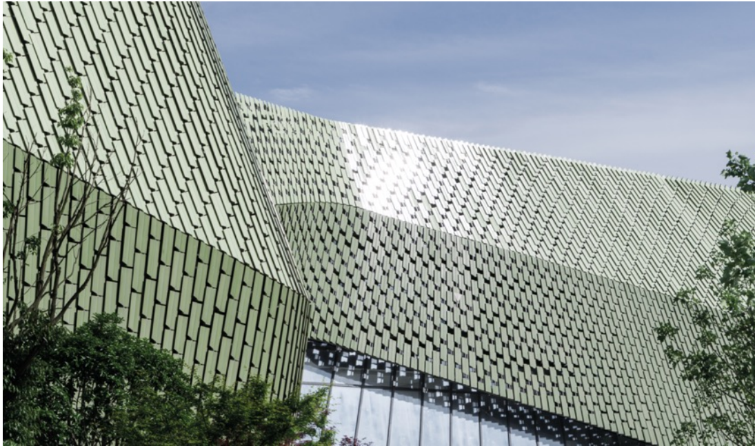
NINGBO URBAN PLANNING EXHIBITION CENTER_playze & Schmidhuber.

PLAYZE architects | Berlin, Basel, Shanghai