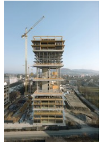
HOLLIGER TOWER_playze & TEN. © ArtefactoryLab