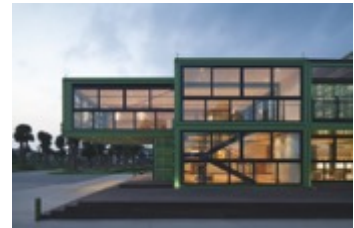
TONY'S FARM_playze. © Bartosz Kolonko