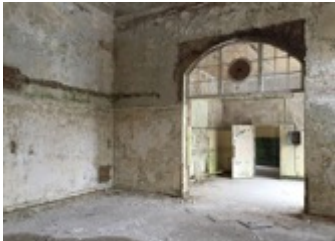
REFUGIUM BEELITZ_playze. © playze