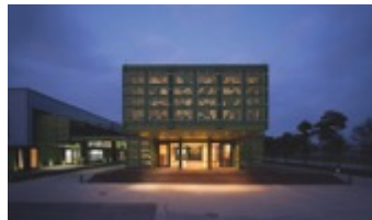
TONY'S FARM_playze.