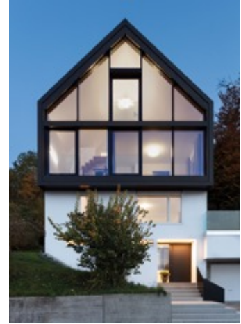
MAISON UITIKON_playze.