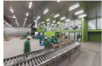
TONY'S FARM_playze.