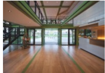
TONY'S FARM_playze.