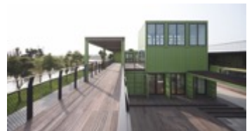
TONY'S FARM_playze. © Bartosz Kolonko