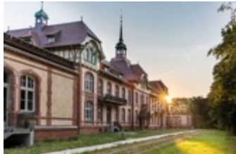
REFUGIUM BEELITZ_playze. © Andreas Schwarz