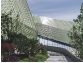
NINGBO URBAN PLANNING EXHIBITION CENTER_playze & Schmidhuber.