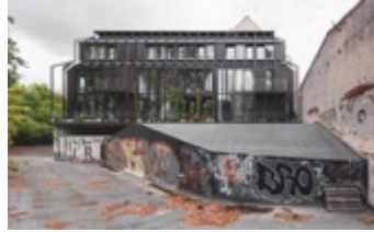
MOOS_playze & Thomas Kröger Architekten.