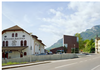
Winecenter Kaltern , Kaltern, IT, 2006