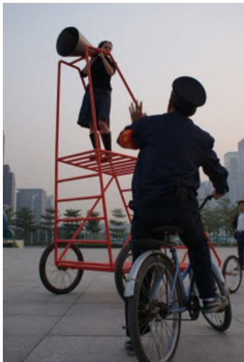
PublicTrailer ®, Shenzhen, CN, 2009/2010 © feld72