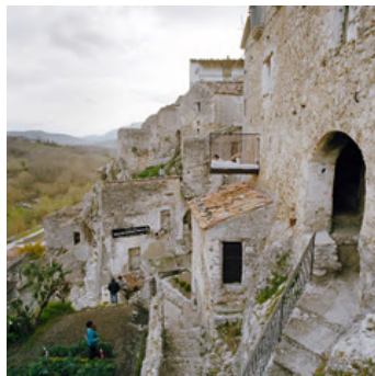
Million Donkey Hotel, Prata Sannita, IT, 2006