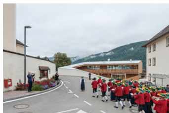
Kindergarten Niederolang , Olang, IT, 2016