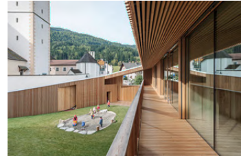
Kindergarten Niederolang , Olang, IT, 2016