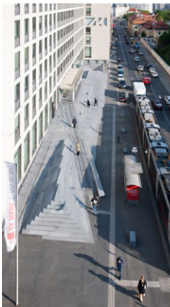
15/32 – Forecourt design of the Vienna Chamber of Labour, Vienna, AT, 2008 © Hertha Hurnaus