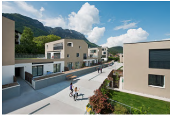
Collective Housing Kaltern , Kaltern, IT, 2010