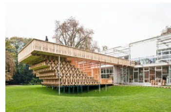
Hochstapler – A temporary festival centre for the steirische herbst, Graz, AT, 2010