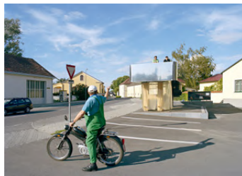
Village square design Wolkon , Mistelbach-Paasdorf, AT, 2007