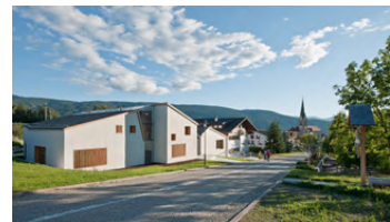
Kindergarten Terenten , Terenten, IT, 2010 © Hertha Hurnaus