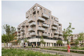
Haus am Park , Vienna, AT, 2018