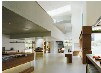
Winecenter Kaltern , Kaltern, IT, 2006