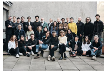
feld72 Team © Vilma Pflaum