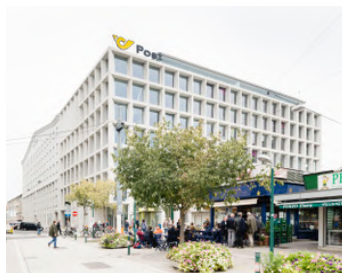
Post am Rochus , Vienna, AT, 2017