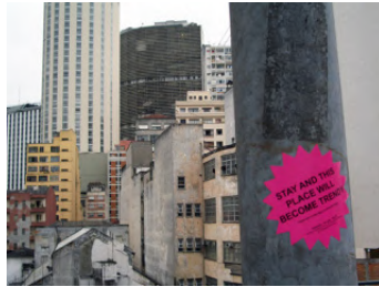
urbanism – for sale! , São Paulo, BR, 2007