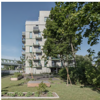
Neu Leopoldau , Vienna, AT, 2019