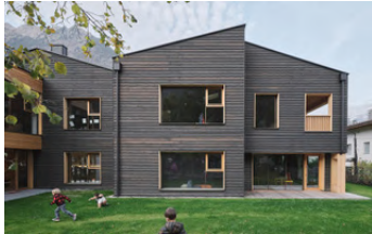
Kindergarten Algund , Algund, IT, 2022