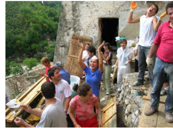
Million Donkey Hotel , Prata Sannita, IT, 2006 @ feld72