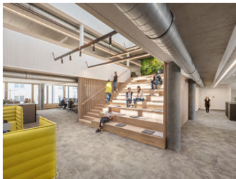
raiffeisen corner , St. Pölten, AT, 2022