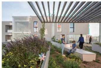
Haus am Park , Vienna, AT, 2018