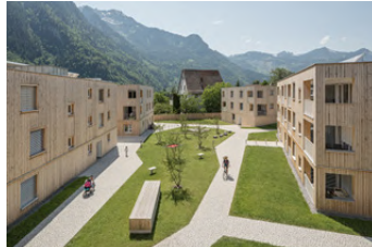
Collective Housing Maierhof , Bludenz, AT, 2019