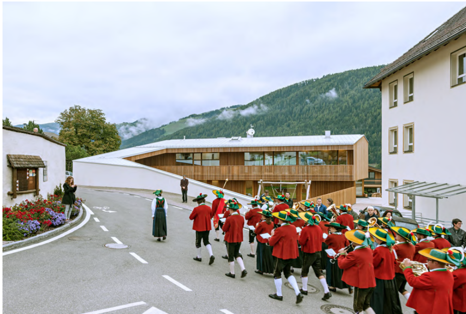
Kindergarten Niederolang, Olting, IT, 2016; Architecture: feld72