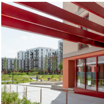
Kapellenhof , Vienna, AT, 2019