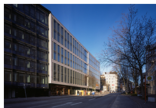
3562_KWK_today_by_Daniel_Sumesgutner Office and commercial building Kaiser-Wilhelm-Kontor in Hamburg today