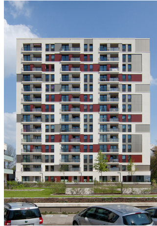
4219_Schenefelder_Holt_today_by_Daniel_Sumesgutner Residential complex Schenefelder Holt in Hamburg today