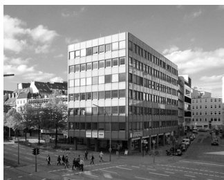
4078_NKK_historical_by_TCHOBAN_VOSS_Architekten Office and commercial building Nikolaikontor in Hamburg before revitalisation