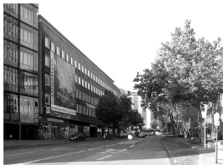
3562_KWK_historical_by_TCHOBAN_VOSS_Architekten Office and commercial building Kaiser-Wilhelm-Kontor in Hamburg before conversion and modernization