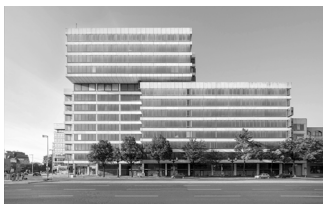
6681_ERP6_historical_by_Lev_Chestakov Office building Ernst-Reuter-Platz 6 in Berlin before revitalisation