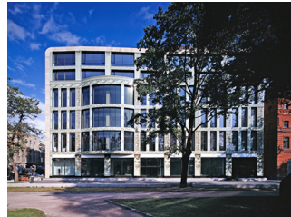
3255_Langenzipen_today_by_Bernhard_Kroll Business and residential building Langenzipen in Saint Petersburg today