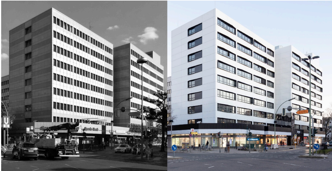
Blissestraße 5; Photo left: Philipp Bauer, Photo right: Klemens Renner