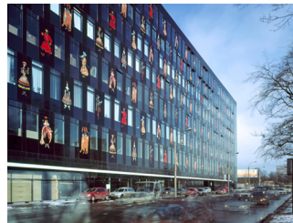
3243_Benois_today_by_Aleksey_Naroditsky Benois House in Saint Petersburg today