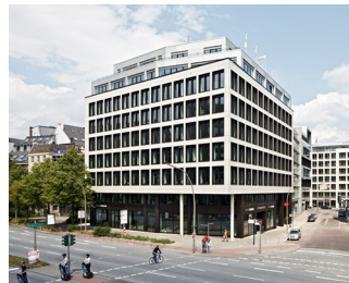
4078_NKK_today Office and commercial building Nikolaikontor in Hamburg today