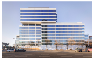
6681_ERP6_today_by_Lev_Chestakov Office building Ernst-Reuter-Platz 6 in Berlin today