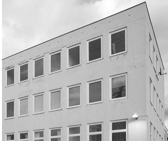
5413_Tuchfabrik_historical_by_TCHOBAN_VOSS_Architekten Commercial centre Tuchfabrik in Berlin before refurbishment and modernisation