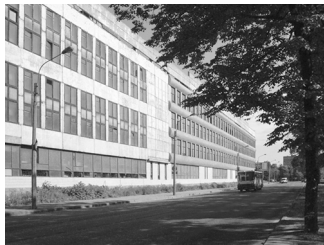
3243_Benois_historical_by_TCHOBAN_VOSS_Architekten Benois House in Saint Petersburg before revitalisation