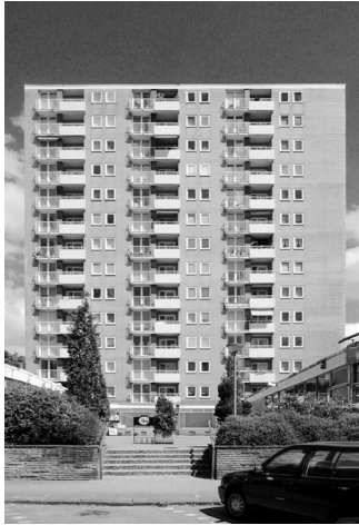
4219_Schenefelder_Holt_historical_by_TCHOBAN_VOSS_Architekten Residential complex Schenefelder Holt in Hamburg before refurbishment and modernisation