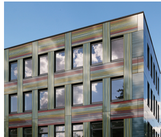
5413_Tuchfabrik_today_by_Greg_Bannan Commercial centre Tuchfabrik in Berlin today