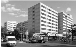
5778_Blisse5_historical_by_Philipp_Bauer Office and commercial building Blissestrasse 5 in Berlin before total refurbishment