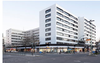
5778_Blisse5_today_by_Klemens_Renner Office and commercial building Blissestrasse 5 in Berlin today