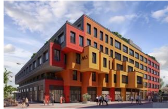
Commercial Quarter Die Macherei, Munich, Germany; Expected Completion in 2021. © HWKN Architecture