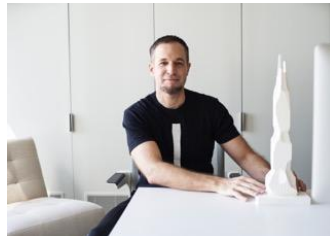
Matthias Hollwich. © HWKN Architecture