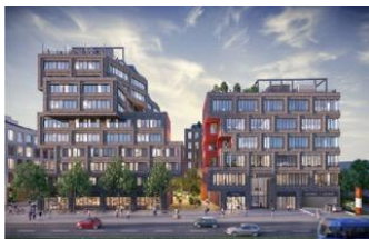
Commercial Quarter Die Macherei, Munich, Germany; Expected Completion in 2021. © HWKN Architecture