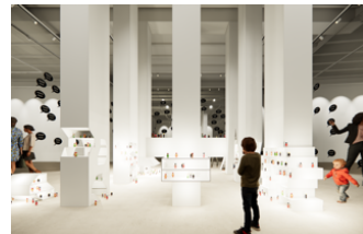
Shape Tomorrow. HWKN Architecture, Exhibition View, Rendering. © HWKN Architecture