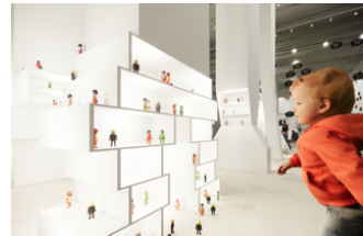
Shape Tomorrow. HWKN Architecture, Exhibition View, Rendering. © HWKN Architecture