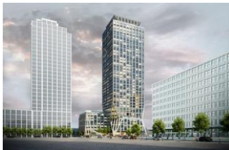
Residential High-rise 351 Marin in Jersey City, NJ, USA; Expected Completion in 2021. © HWKN Architecture