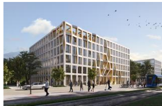
Office Building Spirit Bochum in Bochum, Germany; Expected Completion in 2023. © HWKN Architecture