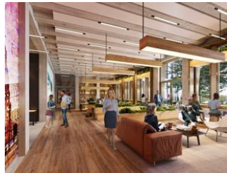
Office Building Spirit Bochum in Bochum, Germany; Expected Completion in 2023. © HWKN Architecture