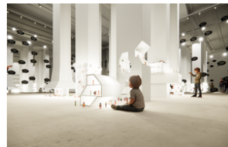
Shape Tomorrow. HWKN Architecture, Exhibition View, Rendering. © HWKN Architecture