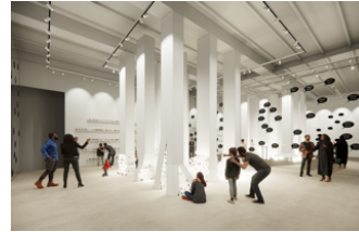
Shape Tomorrow. HWKN Architecture, Exhibition View, Rendering. © HWKN Architecture