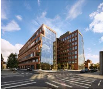
Office Building 25 Kent in Brooklyn, NY, USA; Completed in 2019. © HWKN Architecture