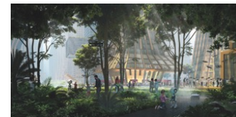
Tomorrow's Party, Rendering. © HWKN Architecture