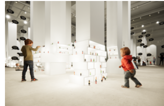
Shape Tomorrow. HWKN Architecture, Exhibition View, Rendering. © HWKN Architecture