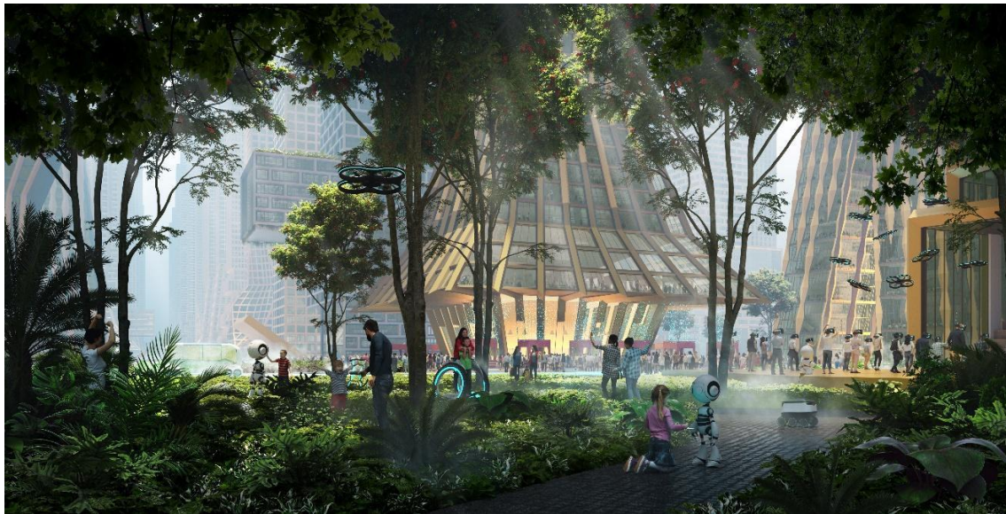
Tomorrow's Party , HWKN's vision for a user inspired, memory generating, urban environment; Rendering.

Towards a Future-Oriented Built Environment