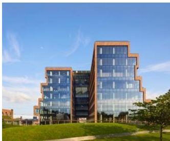
Office Building 25 Kent in Brooklyn, NY, USA; Completed in 2019. © HWKN Architecture