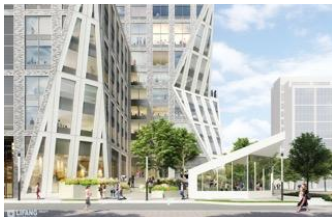
Residential High-rise 351 Marin in Jersey City, NJ, USA; Expected Completion in 2021.