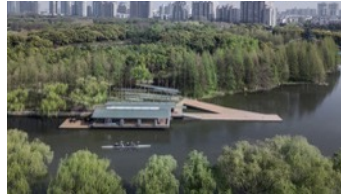
Deep Dive Rowing Club.