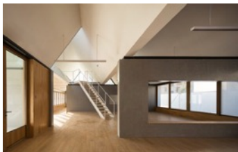
Activity Homes at Yunjin Road. © Liang Shan