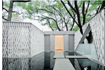
Shanghai Google Creators' Society Center.