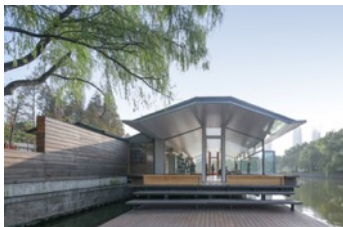
Deep Dive Rowing Club.