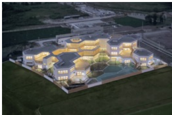
Bilingual Kindergarten Affiliated to East China Normal University.