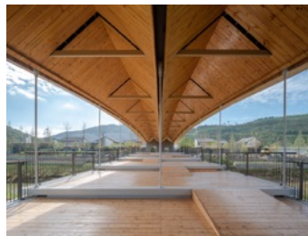
Bridge of Nine Terraces. © Zhu Runzi