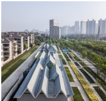
Activity Homes at Yunjin Road.