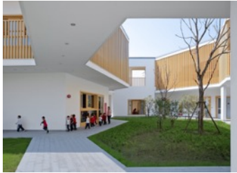
Bilingual Kindergarten Affiliated to East China Normal University.