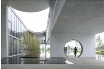
Dongyuan Qianxun Community Center.