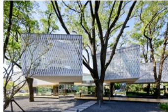
Shanghai Google Creators' Society Center.