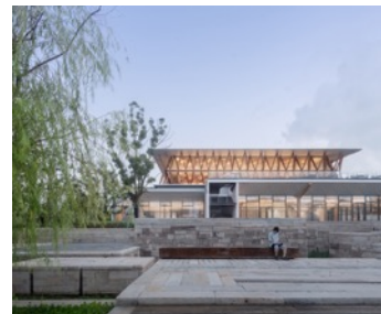
Xitang Naera Art Gallery.