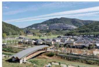
Bridge of Nine Terraces. © Zhu Runzi