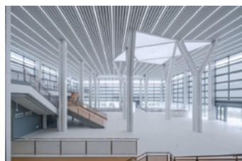
Pudong Adolescent Activity Center and Civic Art Center. © Zhu Runzi