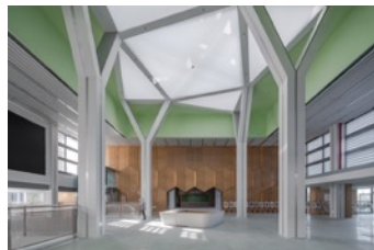
Pudong Adolescent Activity Center and Civic Art Center. © Zhu Runzi