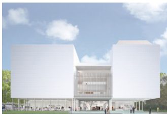
Rendering, view from west © Courtesy of Maki and Associates