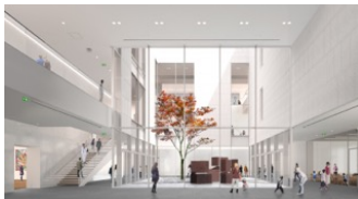
Rendering, main lobby © Courtesy of Maki and Associates