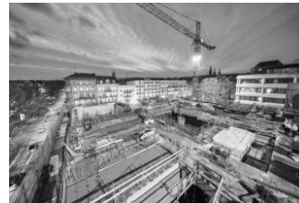
MRE under construction