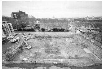
Museum Reinhard Ernst under construction.