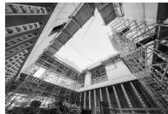
Museum Reinhard Ernst under construction