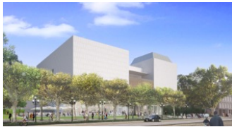
Rendering, view from northwest © Courtesy of Maki and Associates