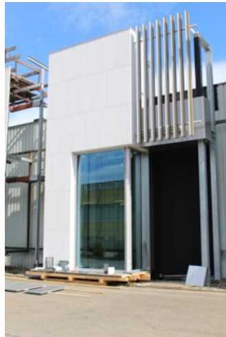
Façade mock-up