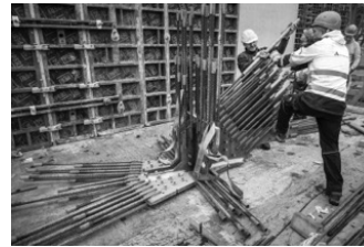
Museum Reinhard Ernst under construction