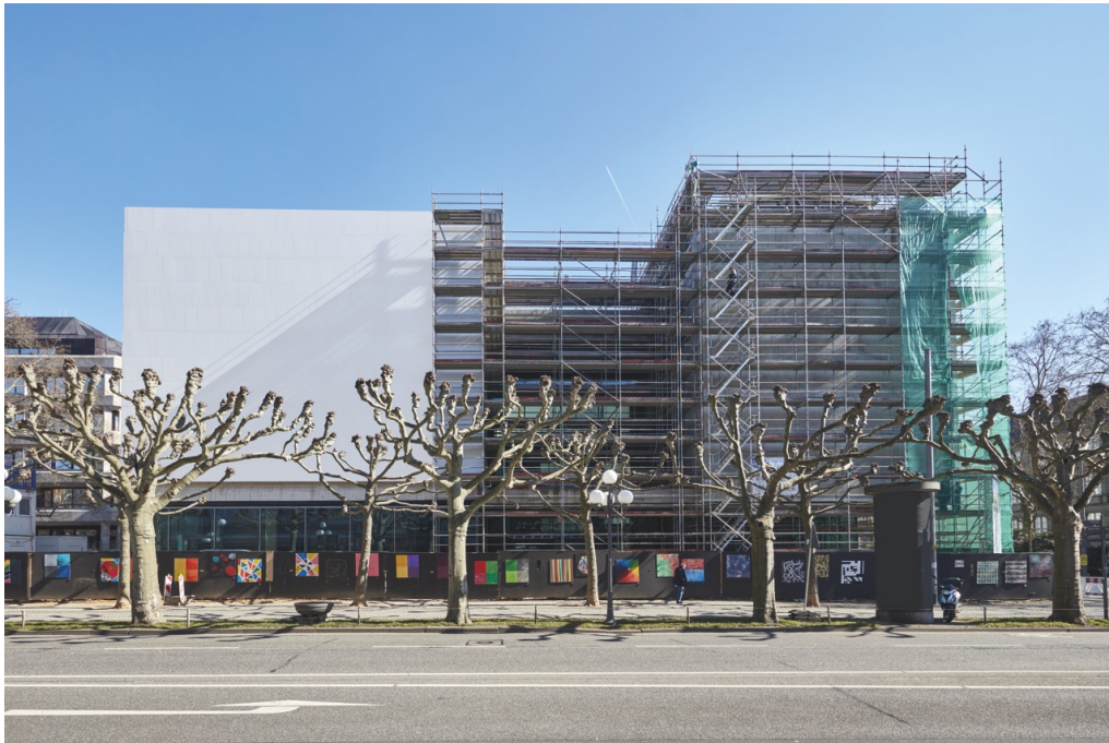
Museum Reinhard Ernst under construction.