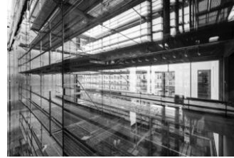
Museum Reinhard Ernst under construction