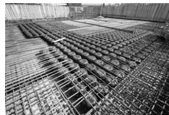
Museum Reinhard Ernst under construction