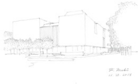
Sketch by Fumihiko Maki © Courtesy of Maki and Associates