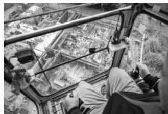
Museum Reinhard Ernst under construction.