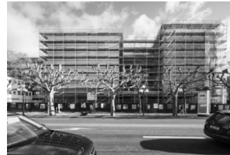
Museum Reinhard Ernst under construction