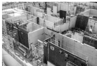
Museum Reinhard Ernst under construction.