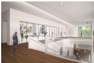
Rendering, second floor lobby