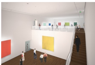
Rendering, exhibition room