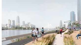
INCLS (One Design), One Hour Loop : A new pedestrian network, Ningbo, China