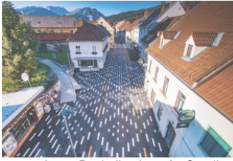
nonconform, Revitalisation of a Small Town Centre, Trofaiach, Austria