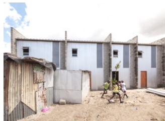
Arch. Alfredo Brillembourg / Urban-Think Tank Design Partners, Empower Shack : A new model for informal settlement upgrading, Khayelitsha, South Africa