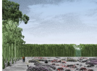
Other Architects, Burial Belt : Rethinking logistics, experience and environmental impact of burial, Sydney, Australia © Other Architects