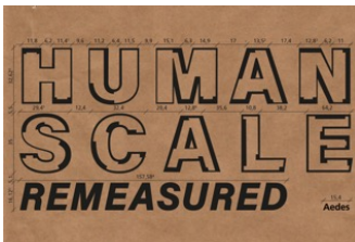
Aedes exhibition, HUMAN SCALE REMEASURED © Aedes