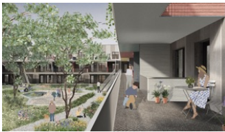
Sauerbruch Hutton, Franklin Village: A multi-generational residential quarter oriented towards the common good, Mannheim, Germany © Sauerbruch Hutton