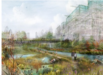
Team Stadsvrijheid, City of the Future : A new connected framework for developing cities, Utrecht, Netherlands