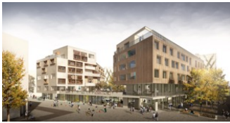
Team WoGen Quartiershaus, WoGen Quartiershaus: Cooperative, ecological-ly sustainable and speculation-free living and working, Vienna, Austria