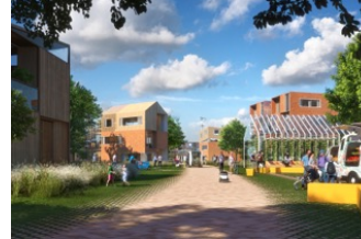
UNStudio / UNSense, Brainport Smart District : A holistic living laboratory for a sustainable, circular and socially cohesive neighbourhood, Helmond, Netherlands