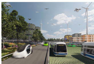
Rogers Stirk Harbour + Partners, The Future Roads of Grand Paris : Transforming motorways into multi-use public corridors, Paris, France