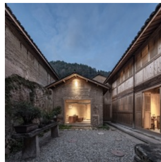
DnA_Design and Architecture, Shangtian Village Revitalisation : Preserving the traditional context and establishing economic opportunities, Shangtian, Songyang County, China