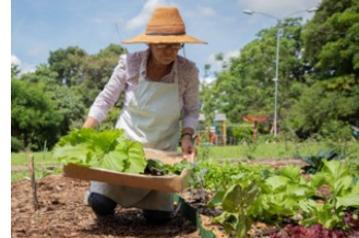
A-01 (A Company / A Foundation), Sweet City Vision : Uniting citizens, fauna and flora in a new type of urban development, Curridabat, Costa Rica