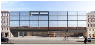
MedUni Campus Mariannengasse, Medical University of Vienna.