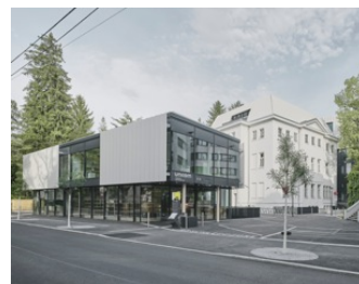
Unicorn and Building of the Austrian Students Union, University of Graz.