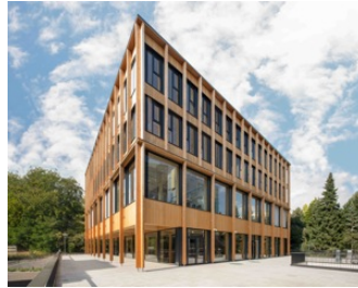
Ilse Wallentin Haus, University of Natural Resources and Life Sciences, Vienna.