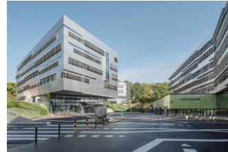
Science Park, Johannes Kepler University Linz.