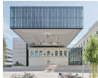
University Library, University of Graz.