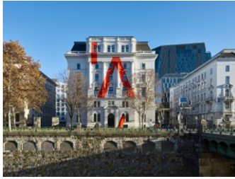
Vordere Zollamtsstraße 7, University of Applied Arts Vienna