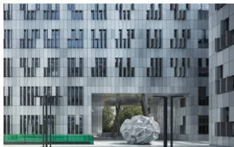
Campus of the Medical University of Graz.