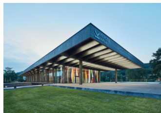
Kepler Hall, Johannes Kepler University Linz.