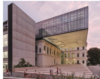
University Library, University of Graz.