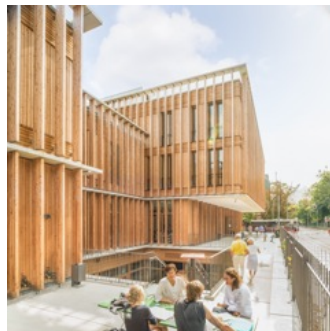
Tüwi, University of Natural Resources and Life Sciences, Vienna.