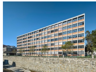
Schwanzer-Trakt, University of Applied Arts Vienna.