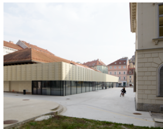
Theater im Palais, University of Music and Performing Arts Graz.