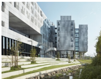
Campus of the Medical University of Graz.