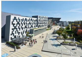
Campus of the Vienna University of Economics and Business.