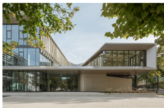
Future Art Lab, mdw – University of Music and Performing Arts Vienna.