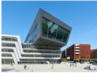
Library & Learning Center, Vienna University of Economics and Business.