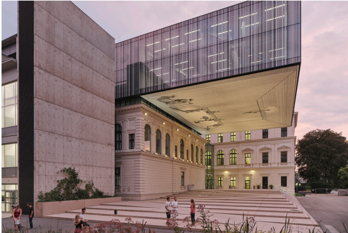
University Library, University of Graz.

The university as an urban campus – Nine examples from Austria