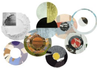
Collage, project Olive West , St. Louis, Missouri, USA. © Tatiana Bilbao Estudio