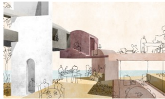
Collage, project Ways of Life , Scheid, Hesse, Germany. © Tatiana Bilbao Estudio