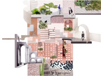
Collage, project Silica II – Roble 700 , San Pedro Garza García, Nuevo León, Mexico. © Tatiana Bilbao Estudio