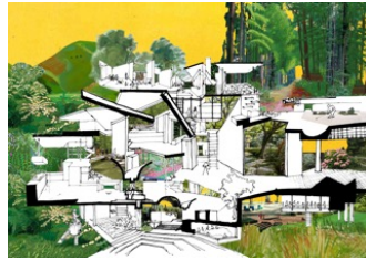
Collage, project Ways of Life , Scheid, Hesse, Germany. © Tatiana Bilbao Estudio