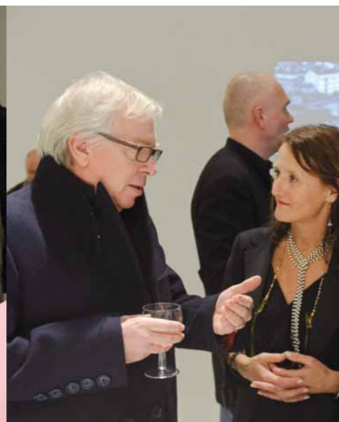
David Chipperfield, Architect, Great Britain