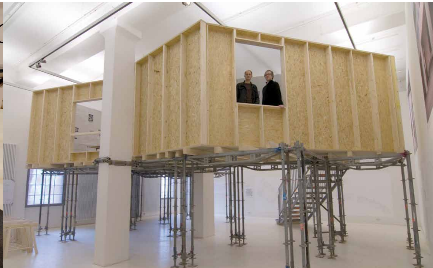
Buildings and Speculations, von Ballmoos Krucker Architekten, Zurich, 2009