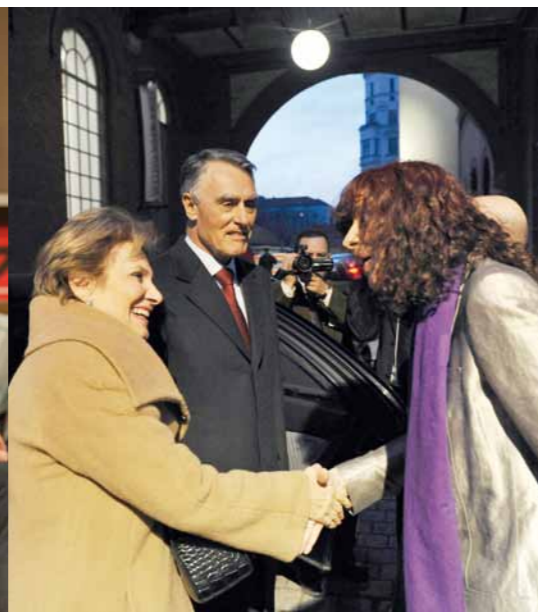
Prof. Dr. Anibal Cavaco Silva, President of Portugal