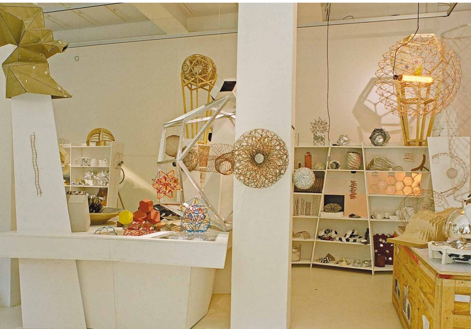
Mediating Space - A Laboratory, Olafur Eliasson, 2006