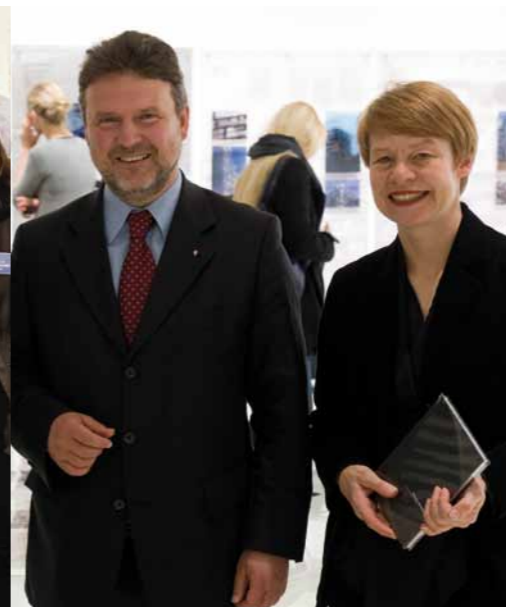
Michael Ludwig Executive City Councillor for Housing, Housing Const- ruction and Urban Renewal, Vienna