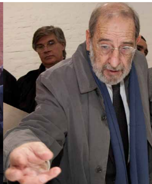
Álvaro Siza, Architect, Portugal