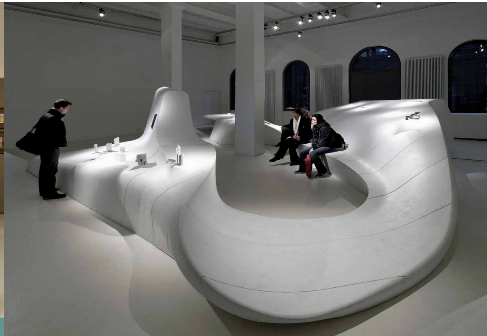
Graftworld, Graft, Berlin, 2007