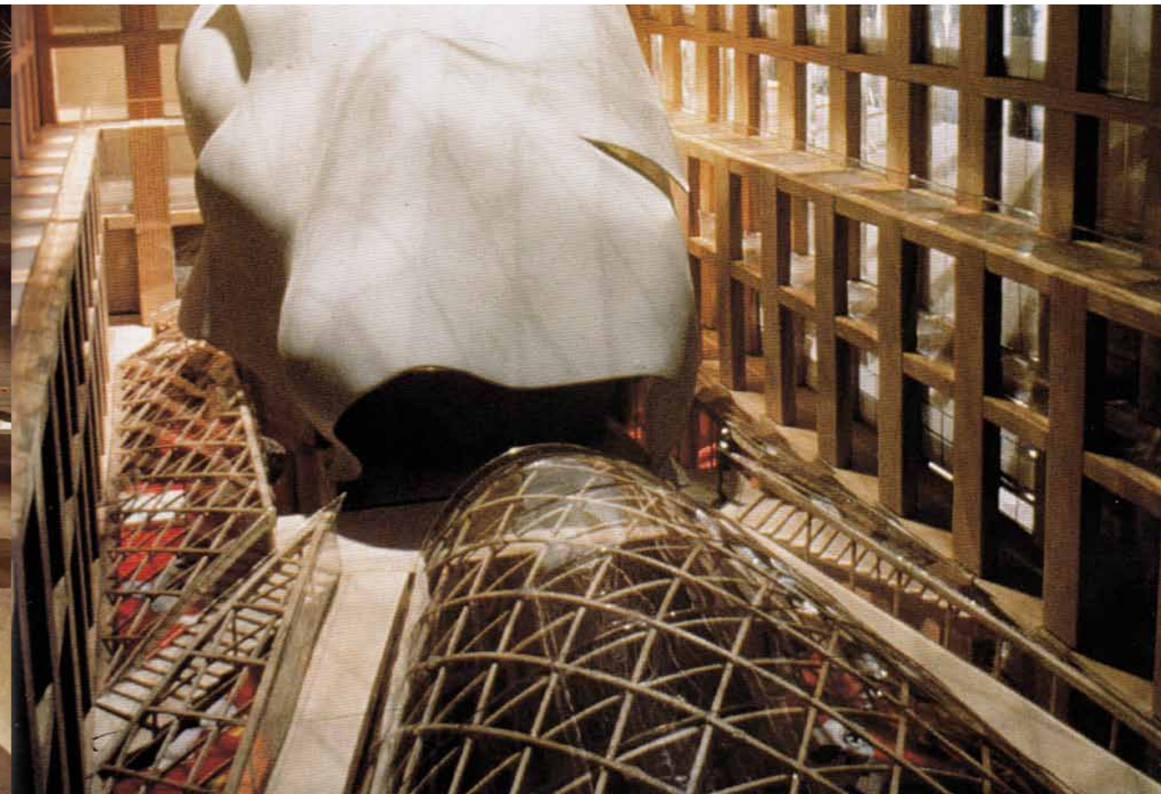
TUMU Young Architecture from China, 2001