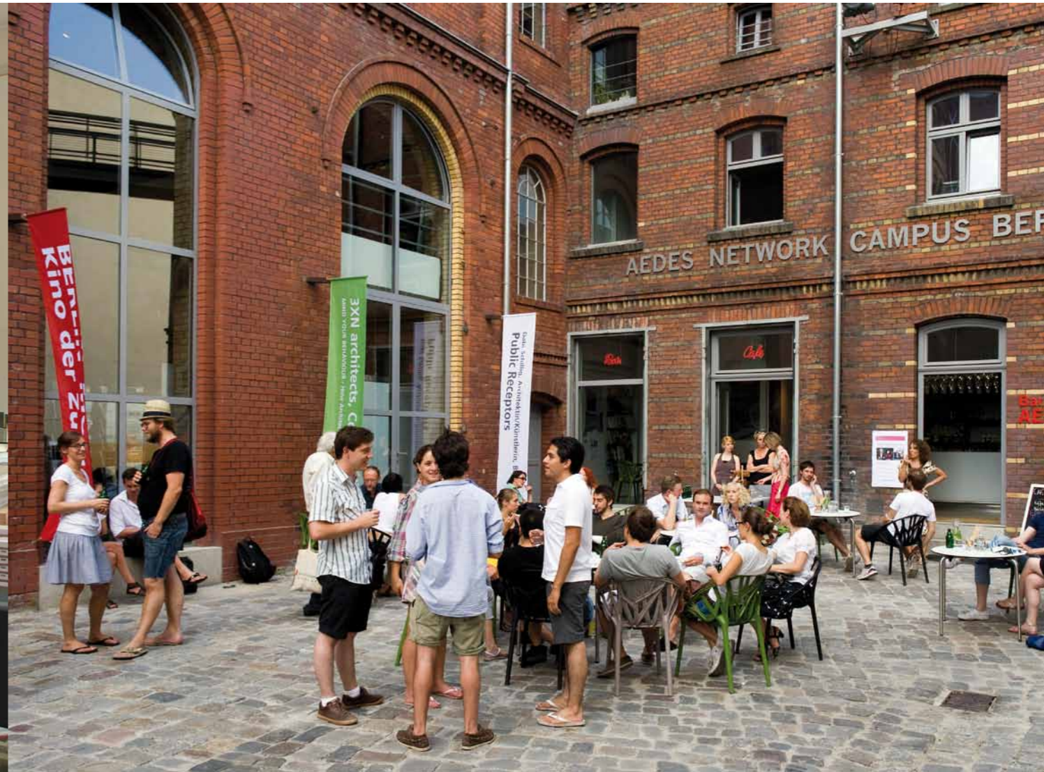
Reception at Aedes am Pfefferberg