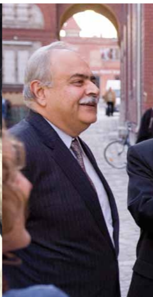
Sudhir Vyas, Ambassa- dor of India in Germany