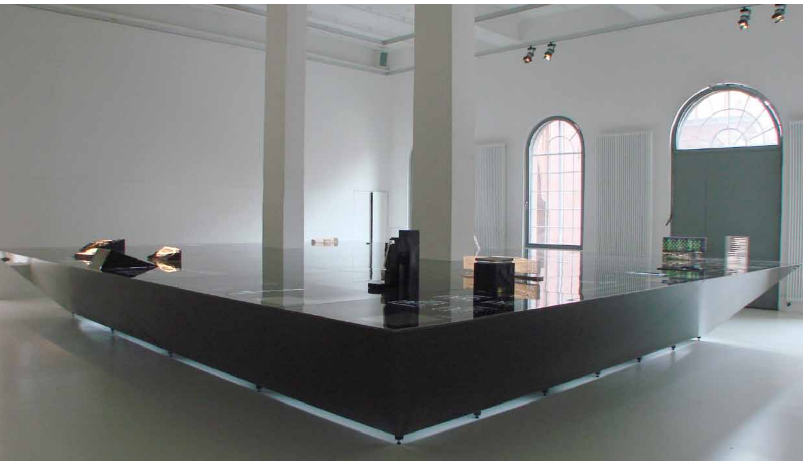
inTENSE repose, Delugan Meissl Associated Architects, Vienna, 2006