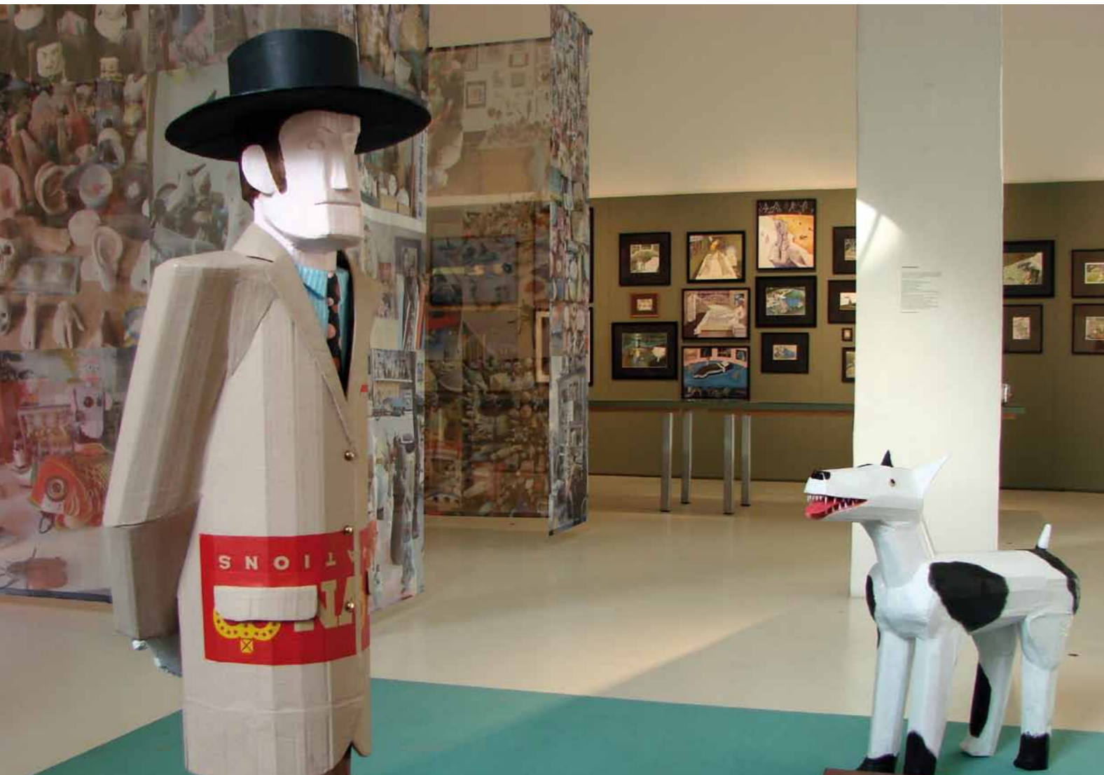
The World of Madelon Vriesendorp, 2008