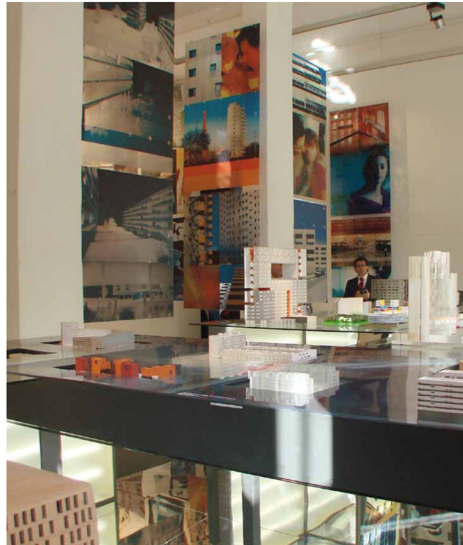
Horizons of Public Housing, Madrid, 2007