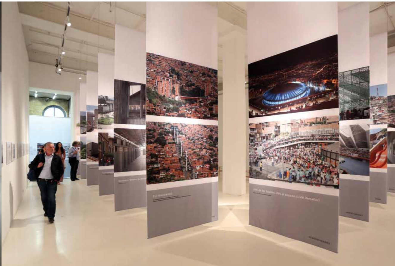
Medellin, Topography of Knowledge, 2015