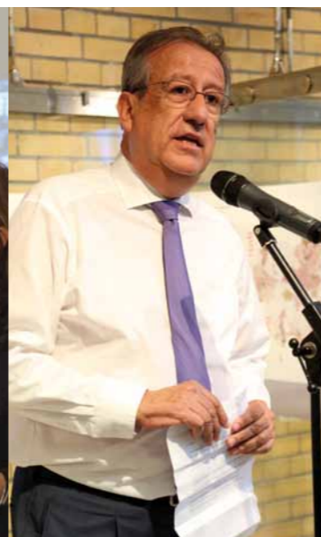
Juan Mayr Maldonado, Ambassador of Colombia in Germany