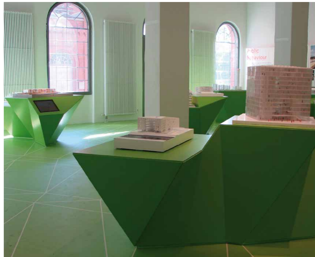
Mind Your Behaviour, 3XN architects, Copenhagen, 2010

ANCB The Aedes Metropolitan Laboratory is the ultimate product of this recent development.