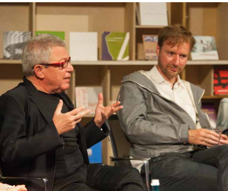
Daniel Libeskind, Architect, USA