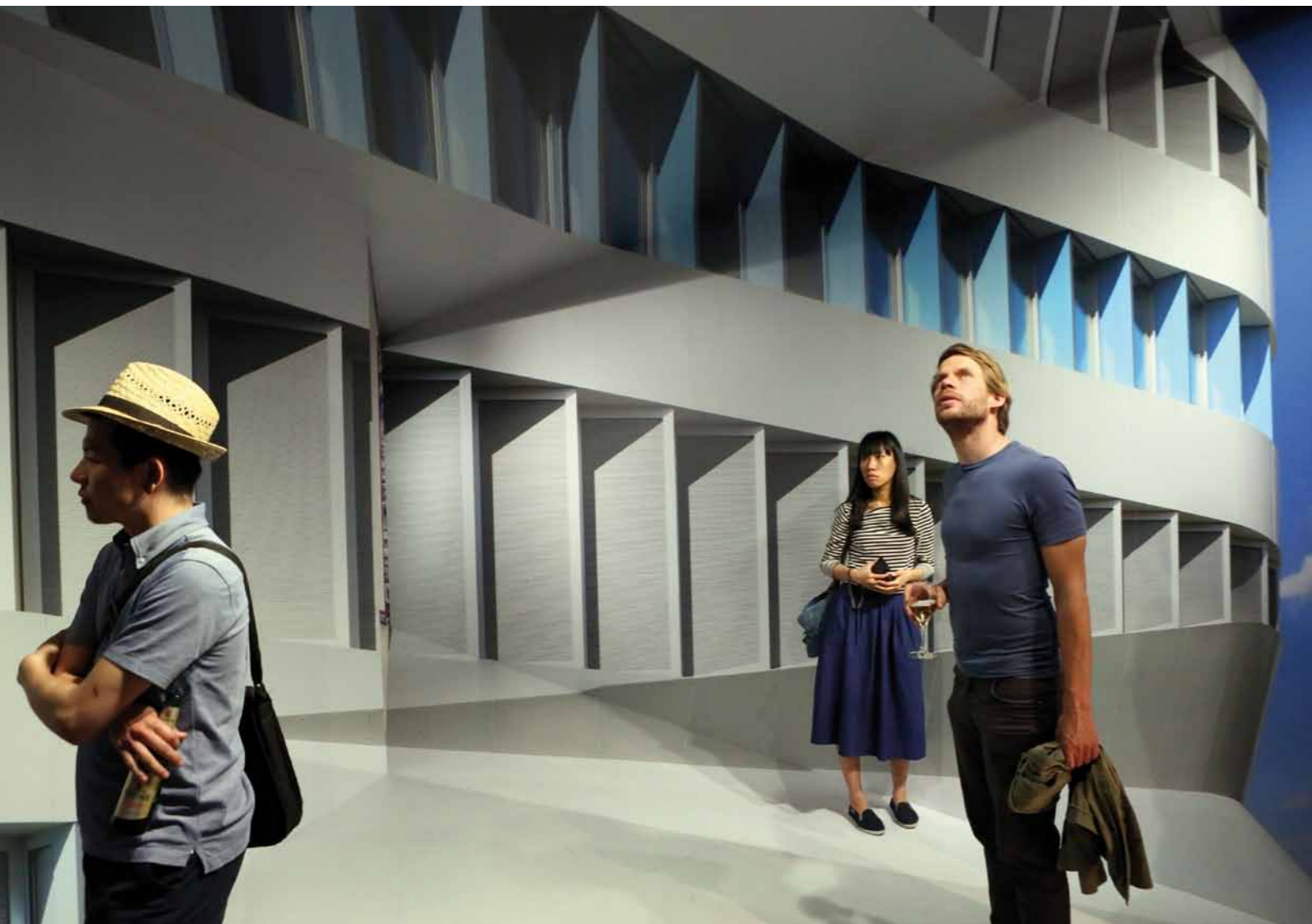
Motion Matters, UNStudio, 2013