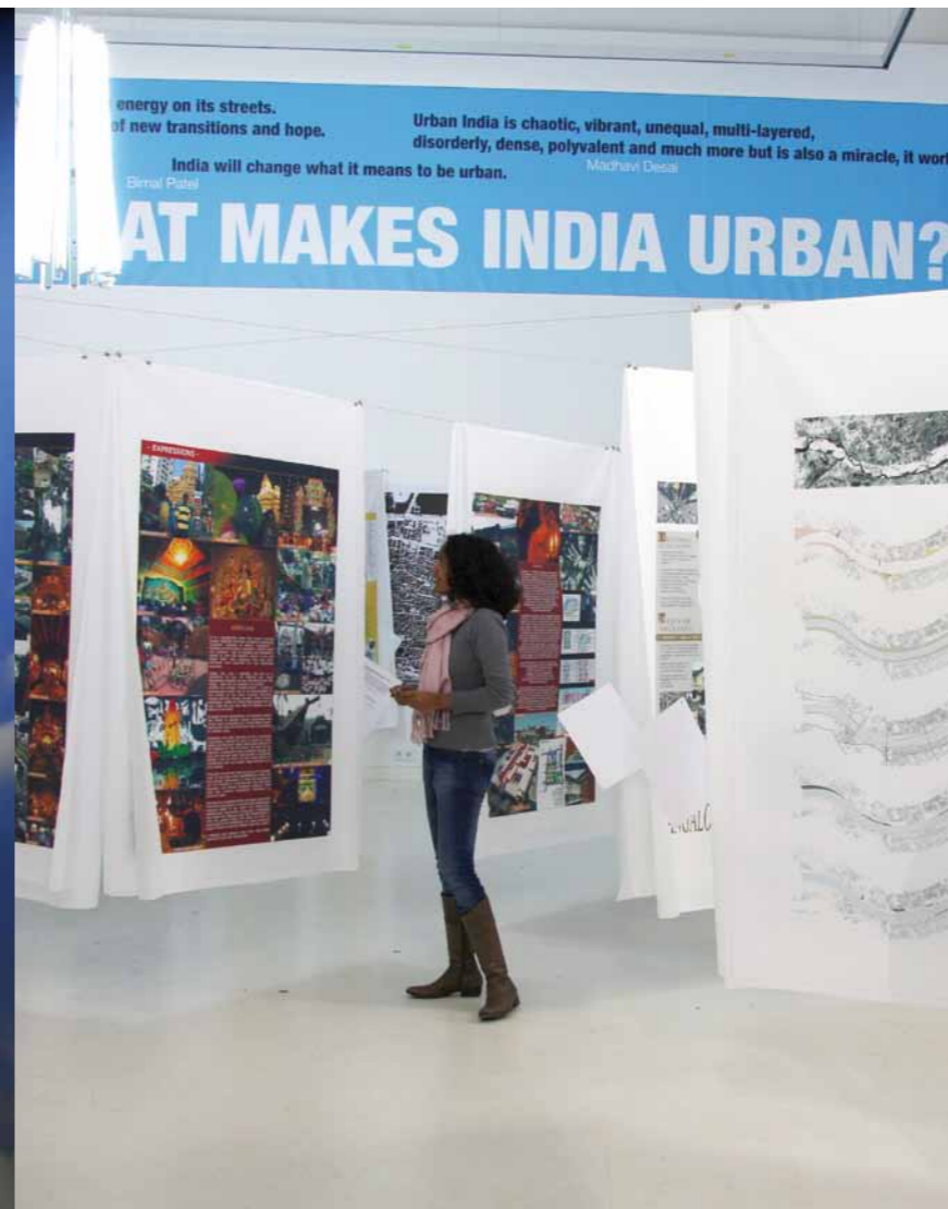
What Makes India Urban?, 2009