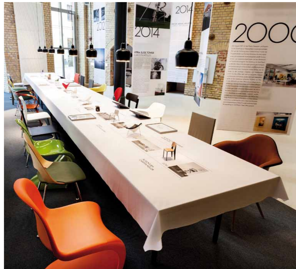
Architecture Design Industry, Vitra Campus, Weil am Rhein, 2014

For many years, embassies and cultural foundations of many countries, have cooperated in the Aedes programme. Since Aedes is not publicly funded, some of its economic base is provided through its cooperation with international companies who continuously support the programme financially. These partners: Zumtobel, Schindler/The Port Technology and Carpet Concept, are actively integrated into the Aedes network and associated with the unique cultural brand of Aedes and its high profile within the fields of architecture and design.