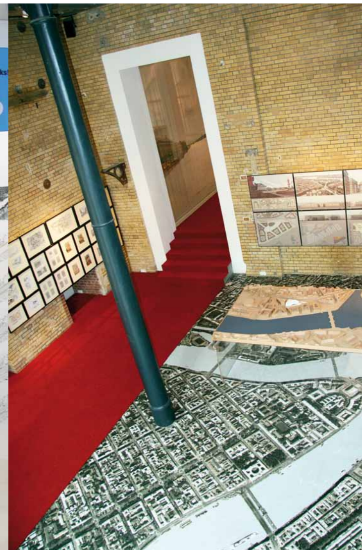
European Embankment, The new dance Theater precinct in St. Petersburg, 2009