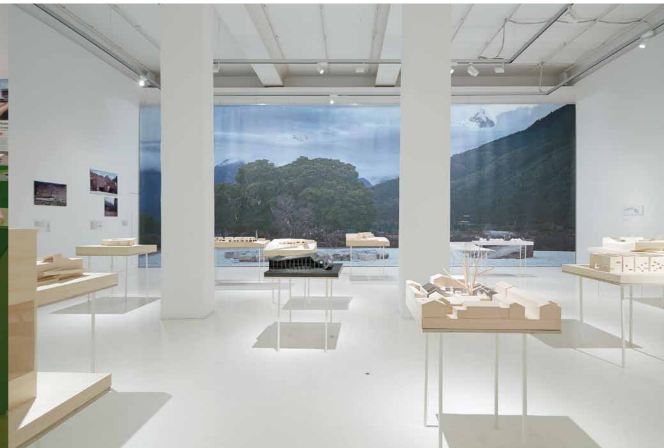
Contemplating Basics, ZAO/standardarchitecture, Beijing, 2015