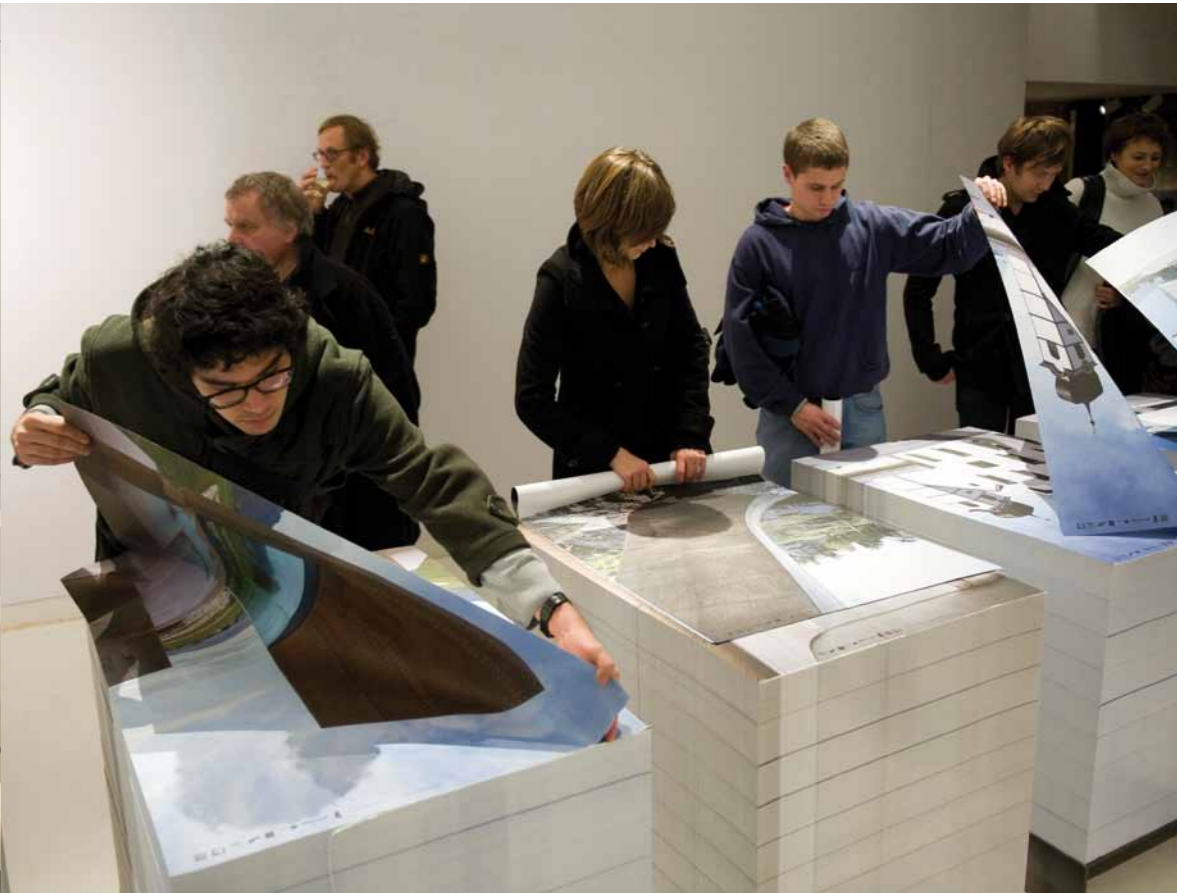
Swiss Shapes, 2006