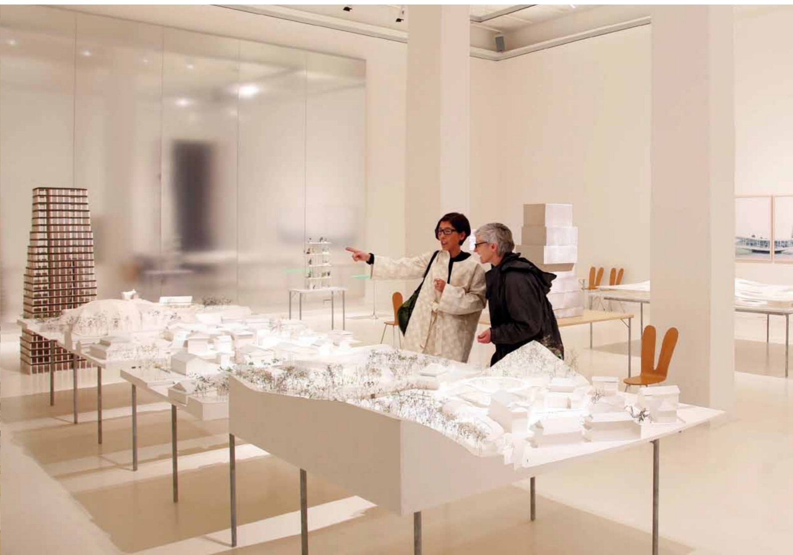
SANAA, Kazuyo Sejima + Ruye Nishizawa, Tokyo, 2010