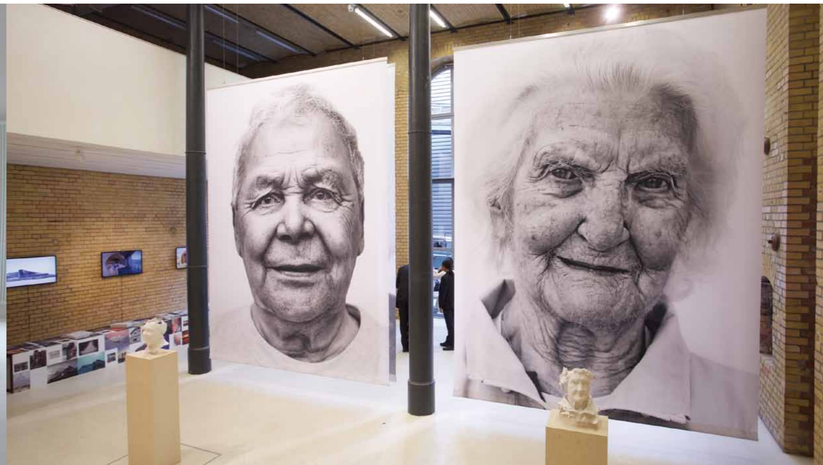
Living the Nordic Light, Snøhetta, Oslo, New York, 2015